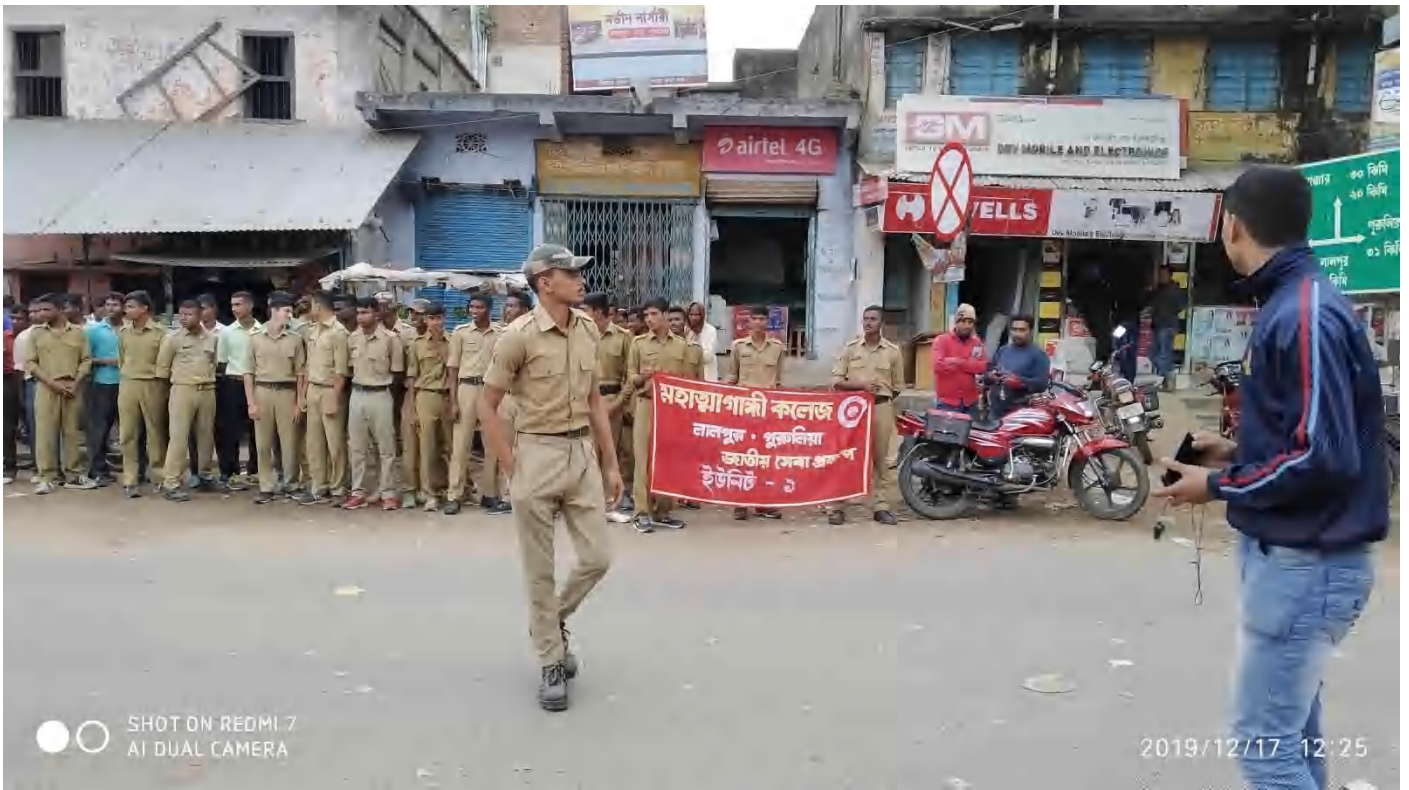
ROAD SAFETY CAMPAIGN AT LALPUR MORE