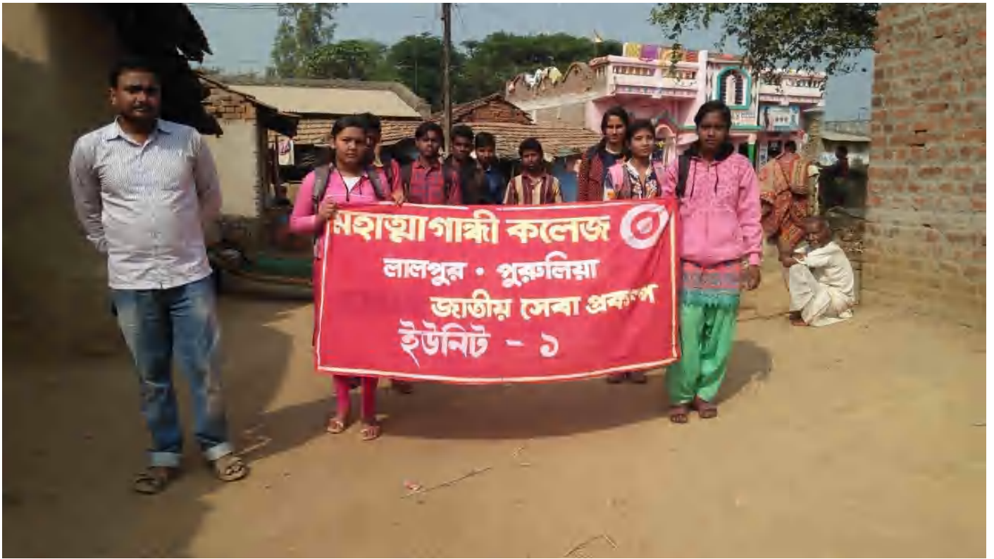
Adopted Village at CHAKALTA

# THE LOCKDOWN FOR CORONA BEGAN IN MARCH 2020.